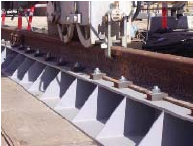
Type TN 150