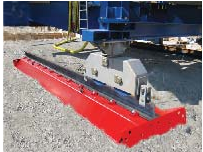
Type TN 406